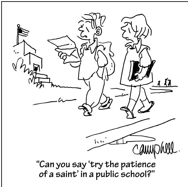
“Can you say ‘try the patience of a saint’ in a public school?”